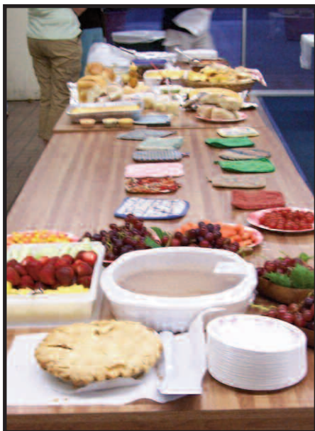
Building "The Spread"

The September Social was held at the Palisades Presbyterian Church and began around 7:00 pm on September 16, 2009. The social consisted of a meal and a presentation. The food that was served was like that which was served to Federal soldiers in the Civil War. The main course consisted of items such as ham, boiled beef, boiled