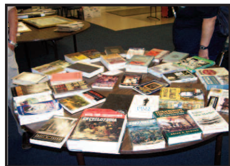
Great Civil War books for sale

Confederate soldiers were thus forced to rely on other methods of obtain their supplies as the war progressed. Packages were sent from home, but the deterioration of the rail system caused food to spoil before arriving, if it arrived at all. Sutlers followed the army to sell them their goods, but their prices were often exorbitant. Local farmers often sold their goods to the soldiers for more reasonable prices. Other times, the food was requisitioned and a promissory note was issued by the quartermaster. With